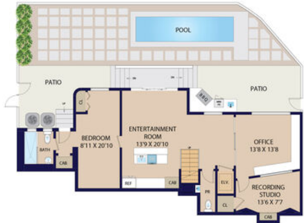
LOWER LEVEL #2